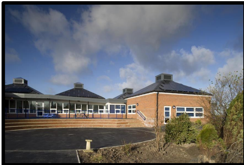
The extension to the rear which was added in 2011