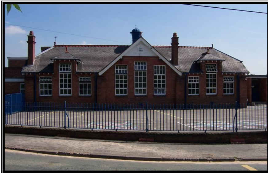
The original building (built in 1909) at the front of our school